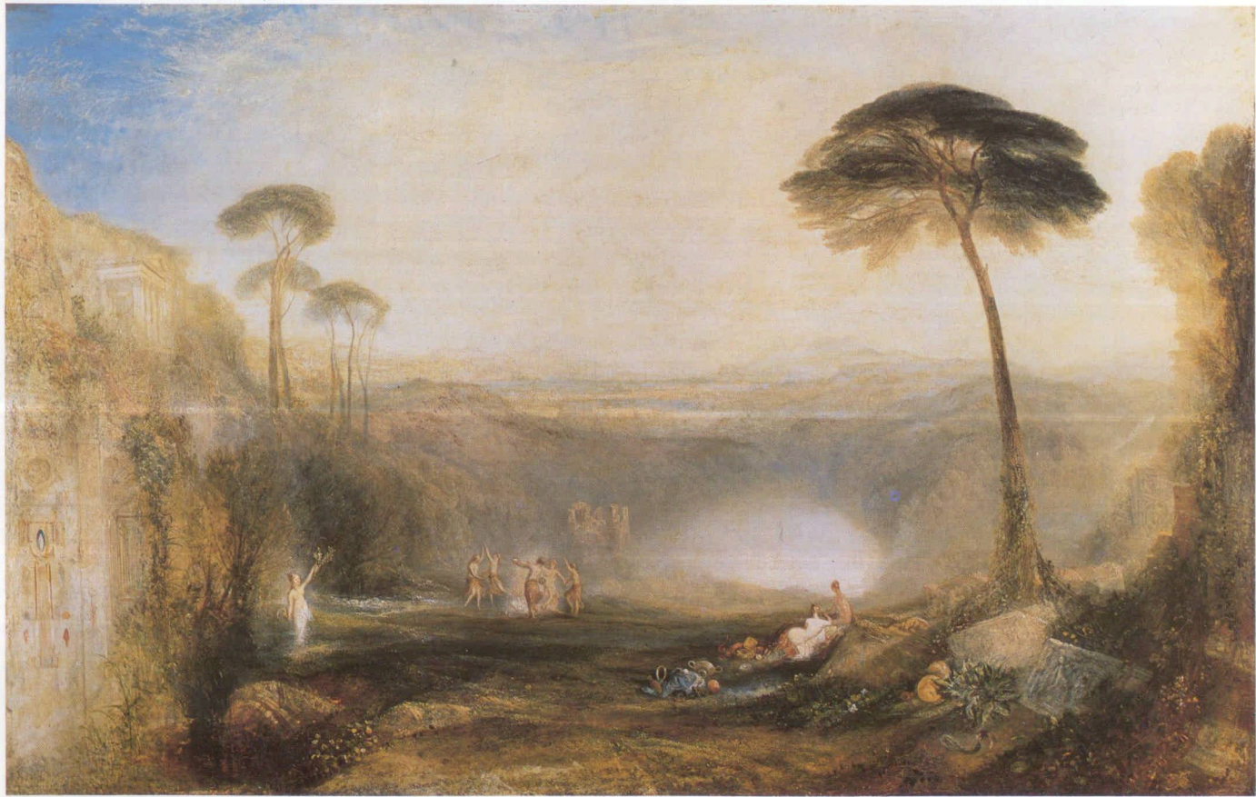
The Golden Bough