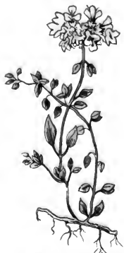
Mother of Thyme.