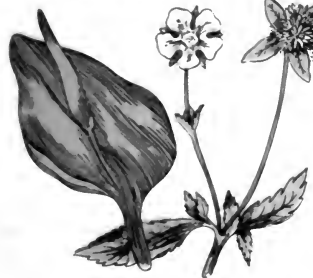
Adders Tongue. Anns.