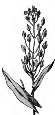
Gold of Pleasure.