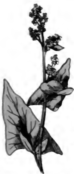
Good King Henry.