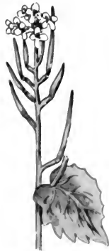
Jack by the Hedge