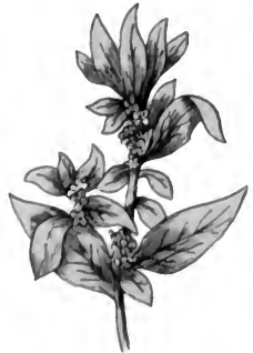
Petitory of the Wall.